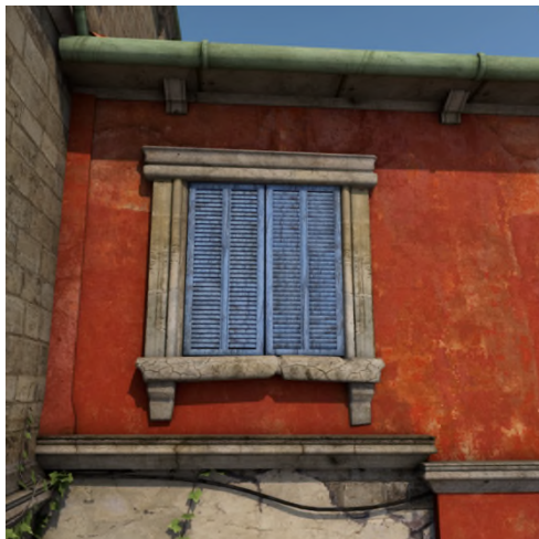
This is a window . — Set vanîzê @ sèt vaini ouzé [set vajnjuze].