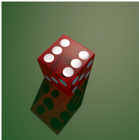
6, six. — S, Si. @ si [si].