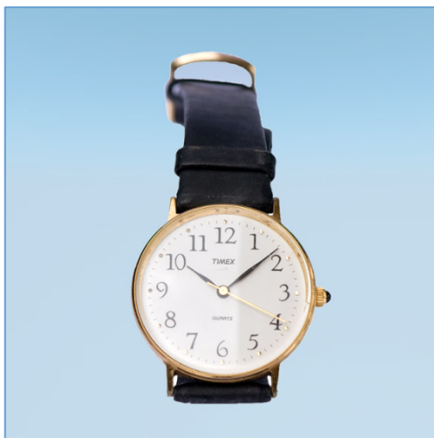
This is a watch . — Set horizune @ sét shoriouziouné [set ʃɔrjuʒune].