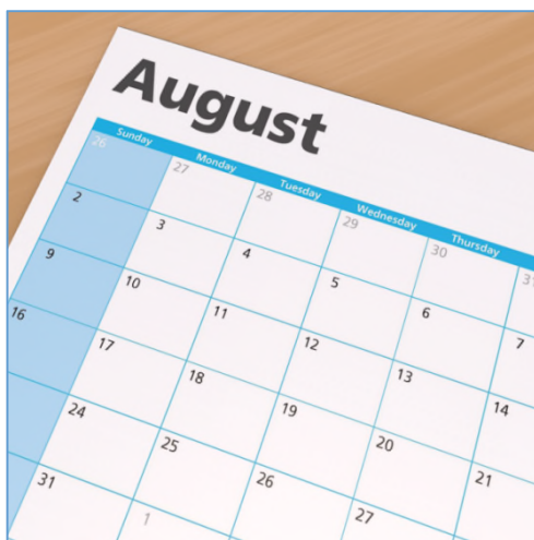
This is a calendar . — Set jourîze @ sét djoïriouzé [set dzɔjrjuze].