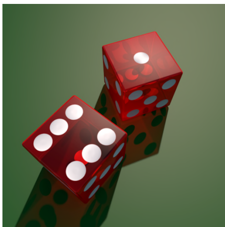
7, seven. — P, Pi. @ Pi [pi].

+, &, and — E, ei, eli @ ê, ê-i, êli [ɛ, ɛi, ɛli]