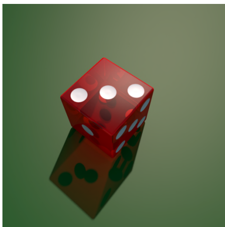
3, three. — T, Ti. @ ti [ti].