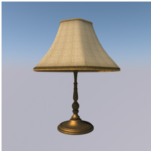
This is a lamp . — Set lavîzé @ sét laïviouzé [set lajvjue].