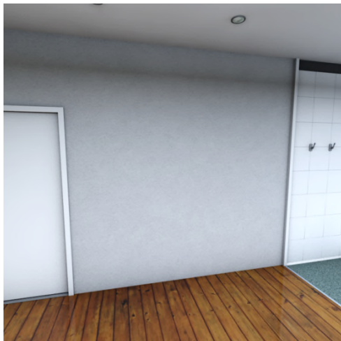
This is a wall . — Set stone @ sét stoiné [set stɔjne].