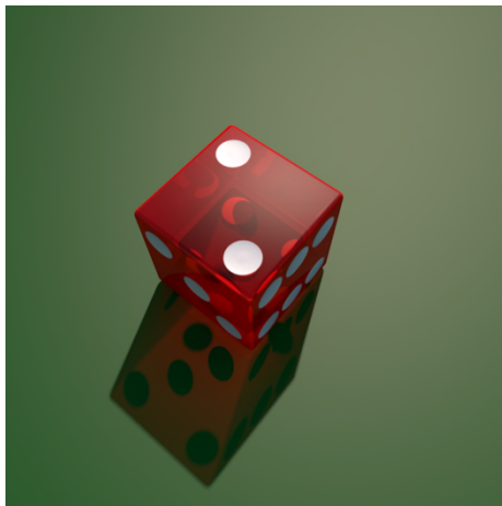
2, two. — D, Di. @ di [di].