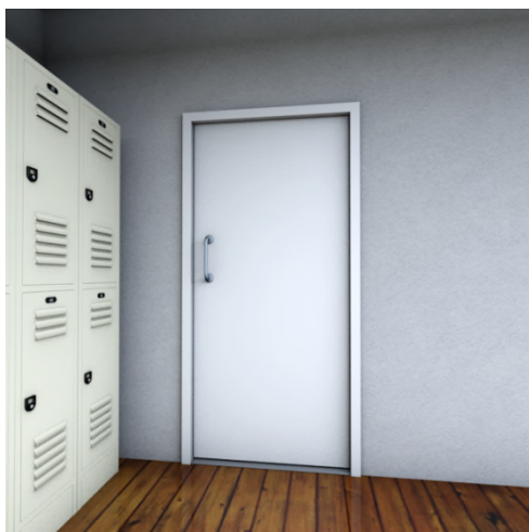
This is a door . — Set pere @ sèt pêir é [set pɛjre].